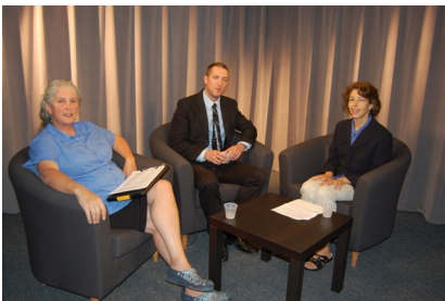
Mattapoisett School Committee "Education Matters"

In closing ORCTV would also like to thank all of our friends from throughout South Eastern Massachusetts who continue to send us quality programming each week. ORCTV also would like to say thank you to all of the groups and individuals who have joined us in the studio during our Spring Community PSA Days. All of the organizations and individuals who have taken part can attest to the positive exposure that several minutes on local cable access can bring to an event, group or charity. We hope that all of you, along with many more new faces, will participate in our next PSA Days event this fall. Until then, enjoy your summer, stay safe on the waterways and we'll see you on TV.