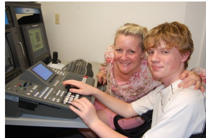
Robbi Around Town